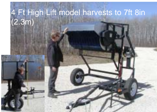
4 Ft High Lift model harvests to 7ft 8in (2.3m)