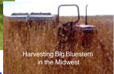
Harvesting Big Bluestem in the Midwest