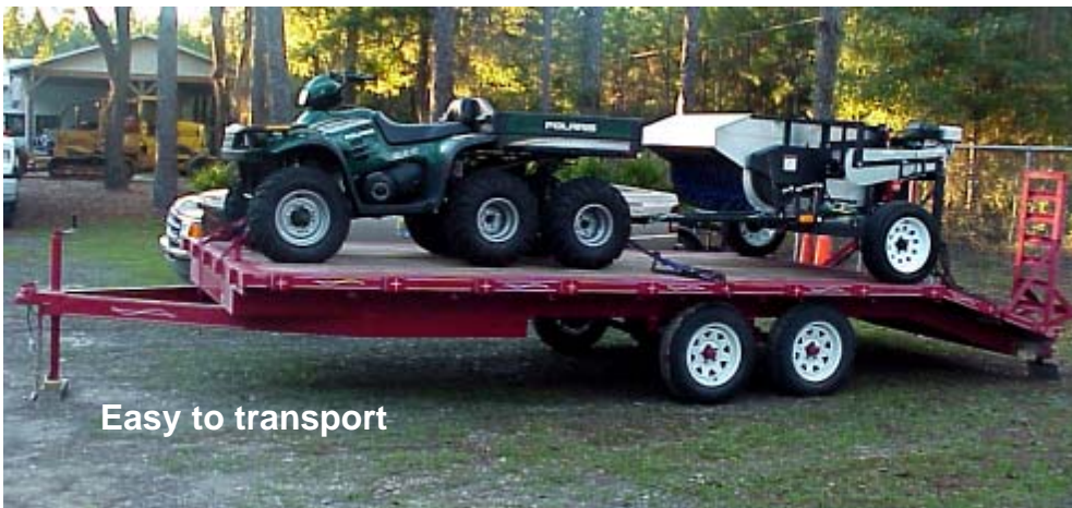
Easy to transport