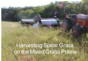
Harvesting Spear Grass on the Mixed Grass Prairie