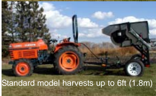
Standard model harvests up to 6ft (1.8m)