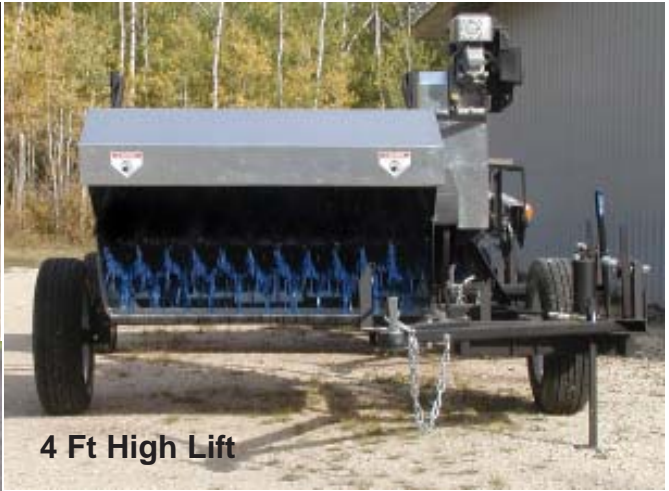
4 Ft High Lift