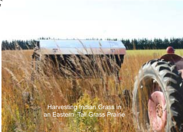
Harvesting Indian Grass in an Eastern Tall Grass Prairie