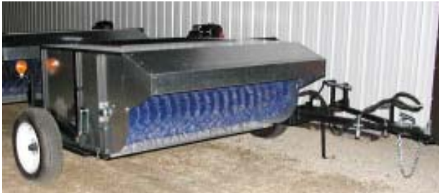
6 Ft Standard