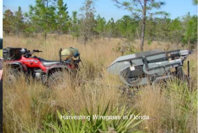
Harvesting Wiregrass in Florida