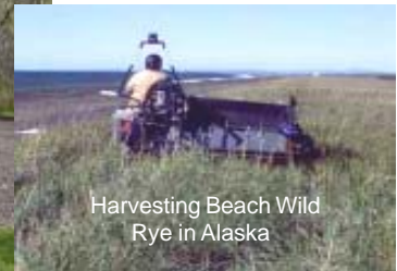
Harvesting Beach Wild Rye in Alaska