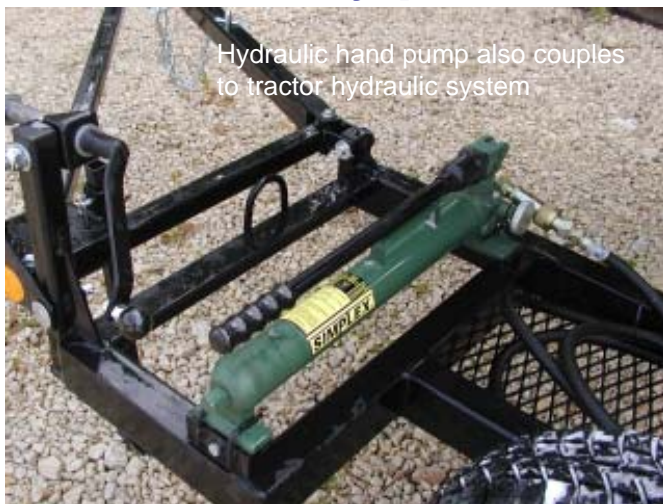
Hydraulic hand pump also couples to tractor hydraulic system