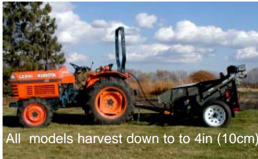
All models harvest down to 4in (10cm)