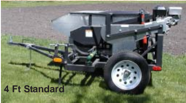
4 Ft Standard